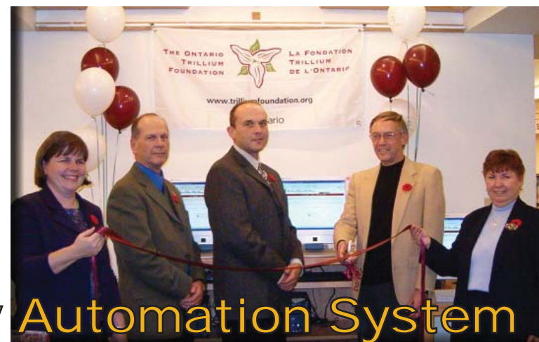
New Automation System