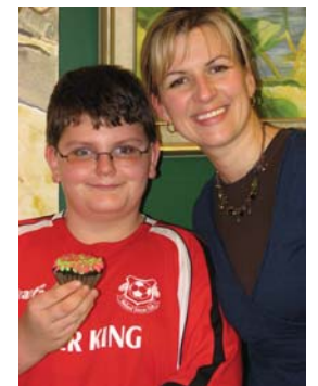
TV personality and cookbook author Anna Olson and friend.