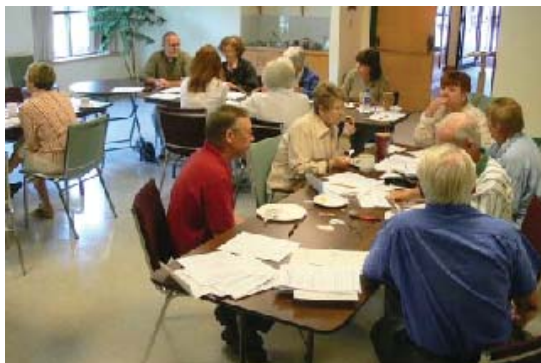
Board and Staff Strategic Planning Session

The Pelham Public Library provides vibrant, efficient, responsive services that fulfill community development needs and anticipates new avenues for expanding our role as the cultural cornerstone of the community.