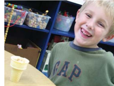
St. Ann's student enjoys a healthy snack as part of the library's outreach sponsored by Healthy Living Niagara.